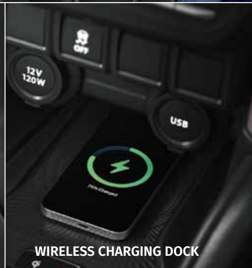
WIRELESS CHARGING DOCK