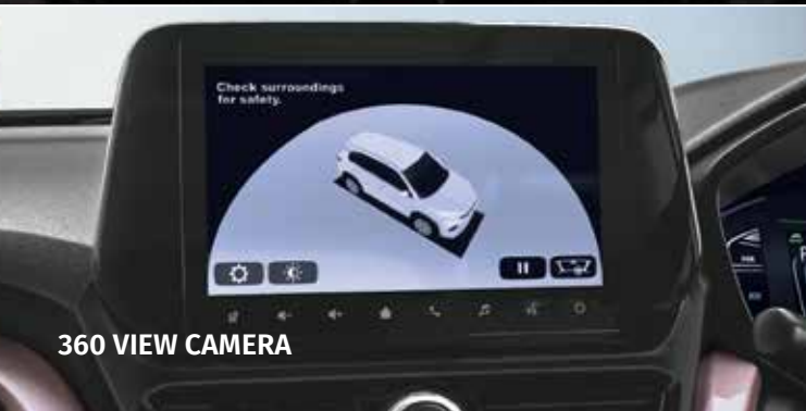
360 VIEW CAMERA

Drawings shown are general specifications of the vehicle.