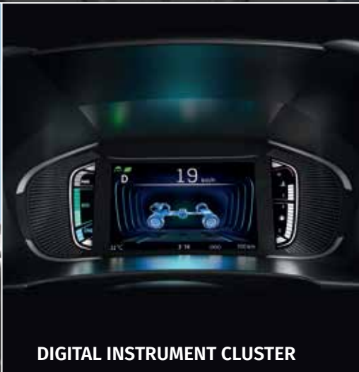
DIGITAL INSTRUMENT CLUSTER