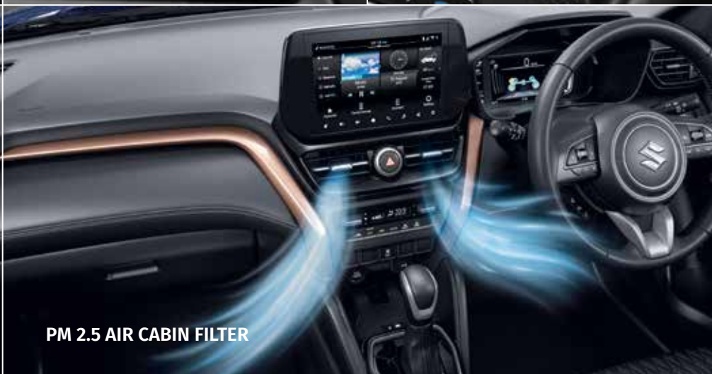
PM 2.5 AIR CABIN FILTER