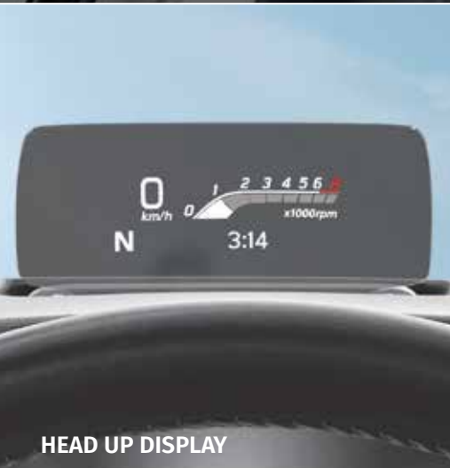
HEAD UP DISPLAY