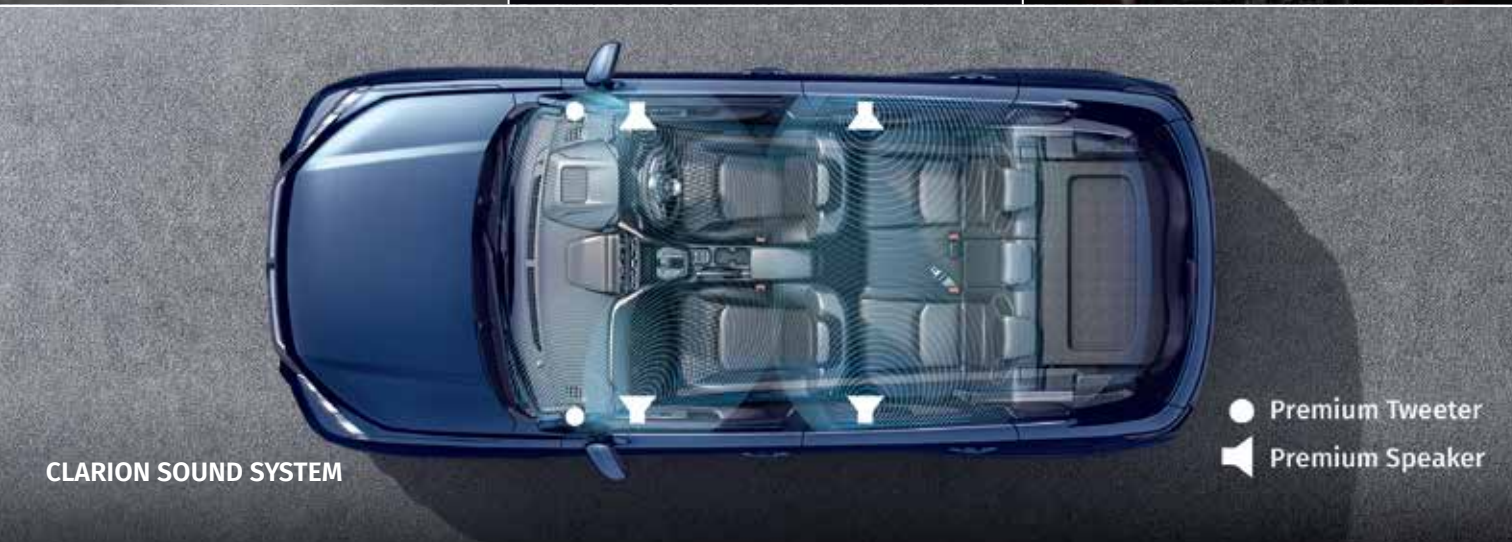
CLARION SOUND SYSTEM