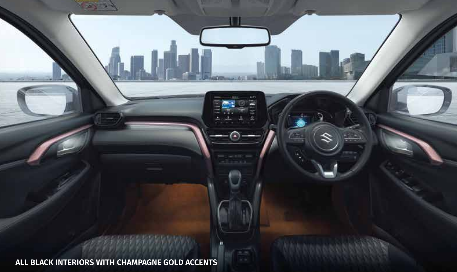
ALL BLACK INTERIORS WITH CHAMPAGNE GOLD ACCENTS