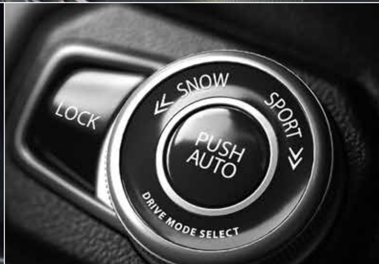
DRIVE MODE SELECTOR