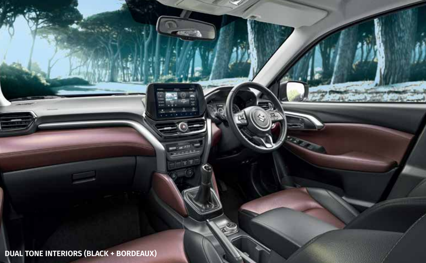
DUAL TONE INTERIORS (BLACK + BORDEAUX)