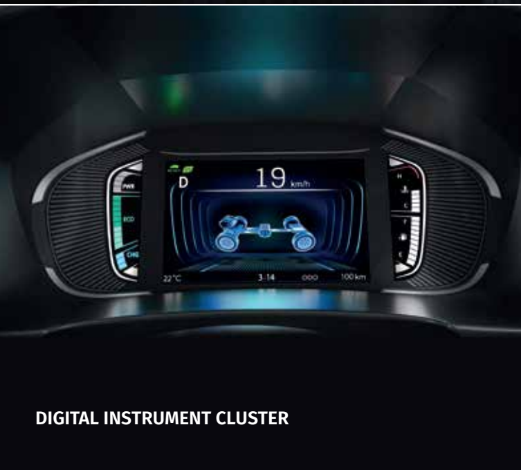
DIGITAL INSTRUMENT CLUSTER